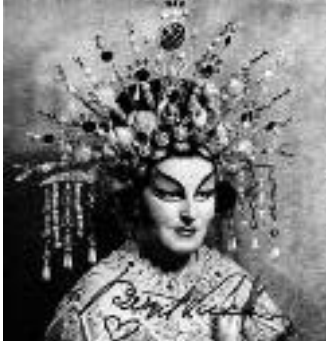
Gina Cigna, the acclaimed 1930s opera singer who performed Turandot without rival: Born Paris, 6 March 1900 - died Milan, 26 June 2001.