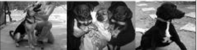
A SELECTION OF DOGS AND CATS AVAILABLE FOR ADOPTION