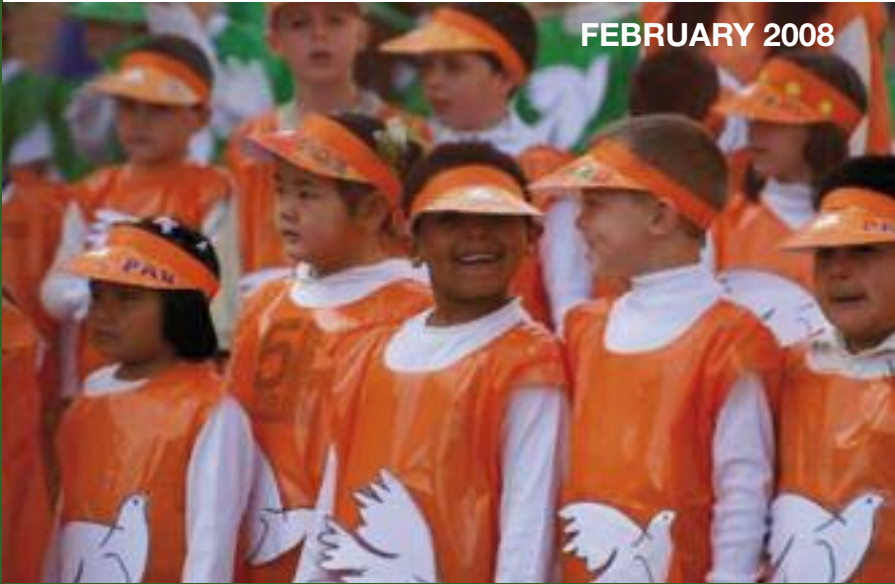
World Peace Day celebrations at Gloria Fuertes Junior School San Miguel de Salinas

Home made Apple Pie 100% Beef Burgers Best chips in town Chicken Burgers Kebabs Pies